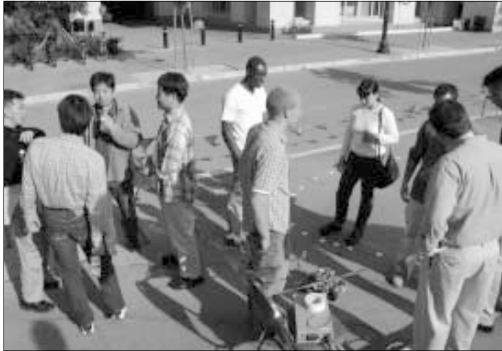
National Semiconductor's NatCar engineering design competition challenges students to solve problems in electronic systems integration through the construction of a 1/10 scale electric car.

Currently Stanford's Electrical Engineering Department is revising its undergraduate curriculum. In very much the spirit of the graduate program, there is a strong interest in using integrated projects to help motivate the students and provide a very